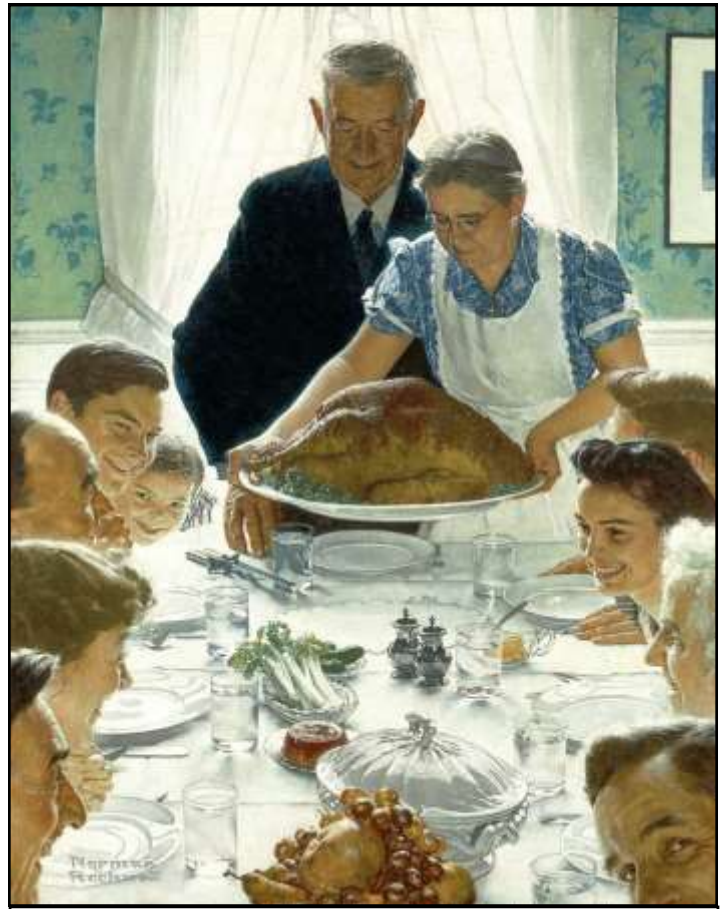
Freedom from Want

showing their thankfulness to God by welcoming and supporting strangers, refugees, and even their enemies. This month we have the community Turkey Drive and our Women of Abundance are helping us provide area families in need with a Christmas dinner too (see page 4). Our Sunday School program is sponsoring a virtual toy drive for the children at CHOP, so stop by their room in the Sunday School wing to see what they are doing or visit their webpage (see below) to make a donation.